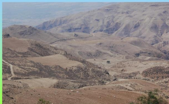
Gospel Acclamation 1Thess 5:18

For all things give thanks to God, because this is what he expects of you in Christ Jesus.