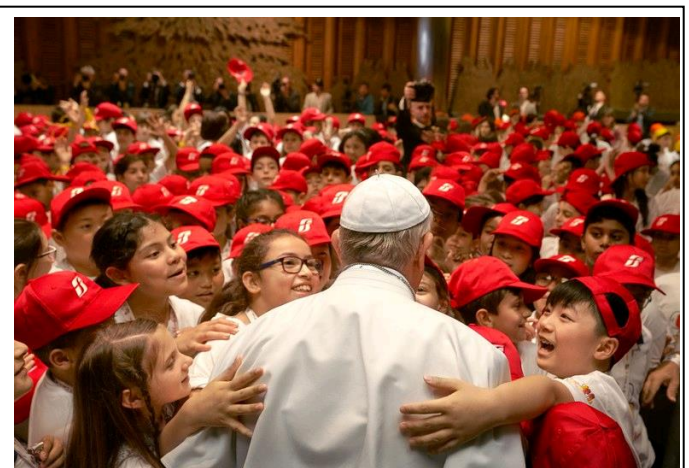
POPE FRANCIS ON BEING ELECTED POPE

Recently a little boy asked Pope Francis what it felt like when he was elected pope.