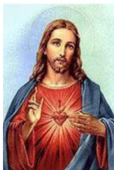
Sacred Heart of Jesus

O most holy heart of Jesus, fountain of every blessing, I adore you, I love you, and with lively sorrow for my sins I offer you this poor heart of mine. Make me humble, patient, pure and wholly obedient to your will. Grant, Good Jesus, that I may live in you and for you. Protect me in the midst of danger. Comfort me in my afflictions. Give me health of body, assistance in my temporal needs, your blessing on all that I do, and the grace of a holy death. Amen.