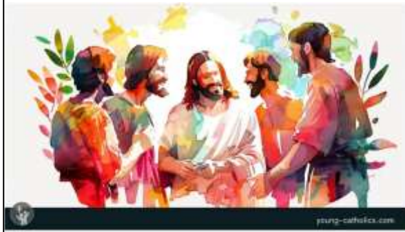
Come away by yourselves to a deserted place and rest a while. – 16th Sunday in Ordinary Time Year B

The 16th Sunday in Ordinary Time Year B highlights the need for rest and prayer in our busy lives. Jesus and His apostles took time to retreat and rest, showing the importance of stepping away from daily demands to connect with God. Jesus often found quiet places to pray, teaching us the value of solitude and reflection. By setting a regular prayer time and finding a quiet place, we can deepen our relationship with God, just as Jesus did. This helps us stay grounded and refreshed in our faith.